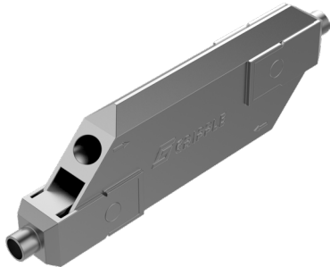
Cable Lock for 1/8" Diameter Cable Zinc Plated (A5-ZOZO-CL-18)