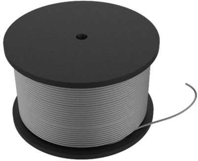
Mounting Aircraft Cable, 1/8" Diameter 302 / 304 Stainless Steel (A5-ZOZO-AC-18-X) X = Specify Length